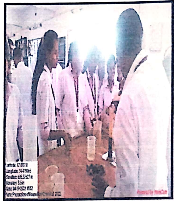
Preparation of White Phenyl, Black Phenyl and Liquid soap